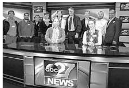
Clergy Leadership Program Cohort

I, and 10 other clergy from various Christian denominations and backgrounds, have been part of the CLP since the Fall of 2017. Every few months we have an all-day seminar that brings us together and engages us in the community. And after every single seminar I get home late, exhausted, but also invigorated. Through this program I have met local legislators, artists, health care leaders, and advocates. This most recent seminar brought me to places like Patriot News/Penn Live, WTIF, and WHTM/ABC27. The focus of the day was lifting up communication between the church and the media. Plus, we got to take a picture in the anchor's chair. So it was a great day had by all!